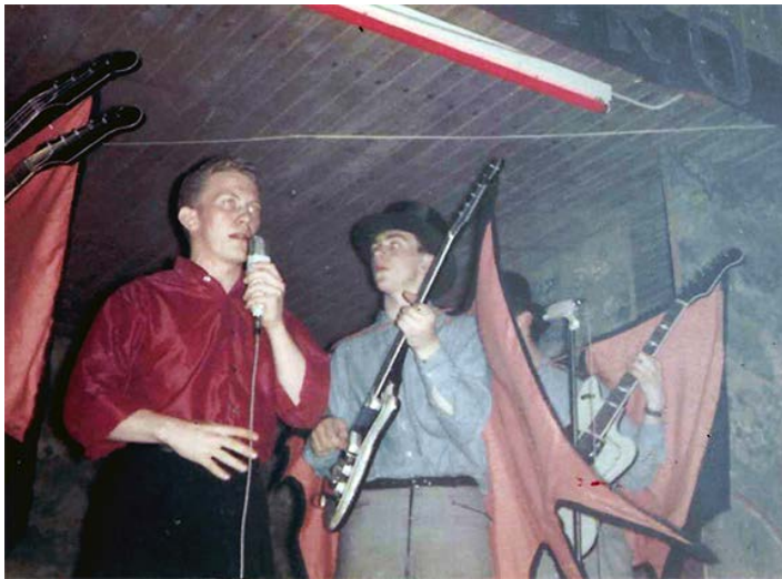
The Vampiros Vampire Show

A: Prior to teaming up with The Five Beats, I sang wherever there was a live band -- mostly in small to medium-sized dance halls -- not unlike the beer and wine clubs in Southern California. As for my repertoire, I sang a lot of Elvis -- "Heartbreak Hotel" was one of my most popular show openers. A particularly powerful set closer was the Ray Charles hit, "What'd I Say." I sang songs by the Everly Brothers, Chuck Berry, Little Richard, The Coasters, Fats Domino, Jerry Lee Lewis, Bill Haley and the Comets and, with the Five Beats, even introduced the Clovers' "Love Potion Number 9" to go with the original Vampire show, carried over from the Vampiros, one of the bands broken up to form the Five Beats. I always loved that song, and it had a spooky, fascinating sound to it that, when you consider most of my German audiences would have had trouble understanding the lyrics, seemed to go really well with the bat-wing capes that hung from the necks of the guitars and electric bass.